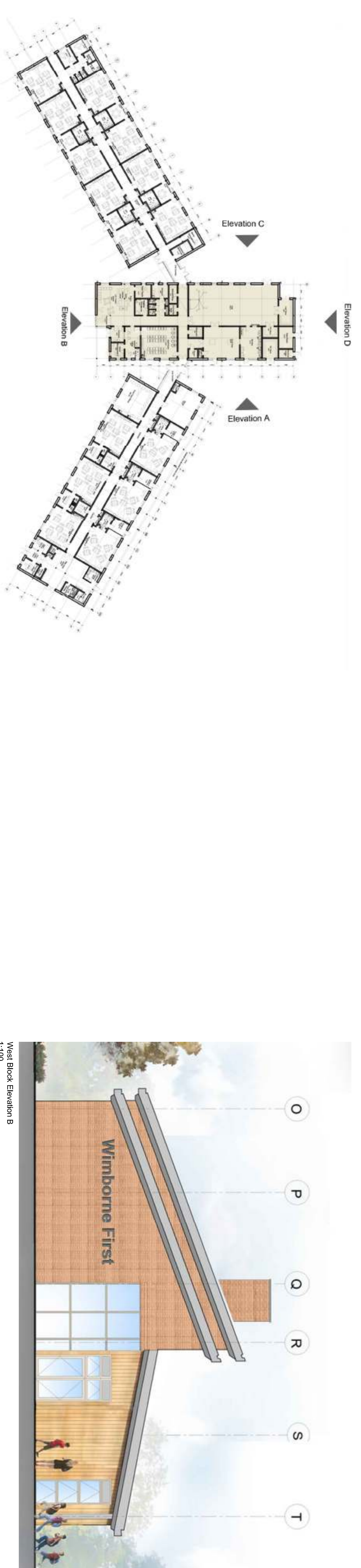
Key Plan 1:300