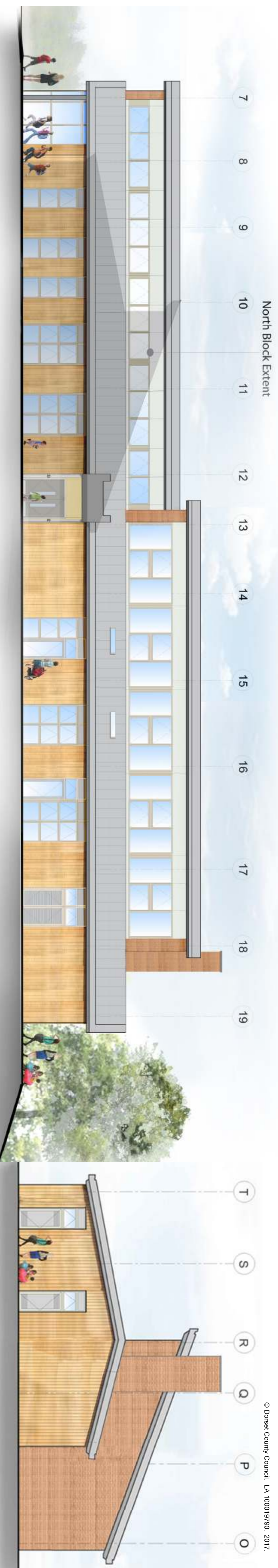
West Block Elevation A 1:100